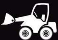
Mini Articulated Loaders