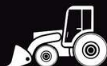
Tractor Front-end Loaders