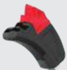
HF14 Ø max 30 cm STANDARD EQUIPMENT