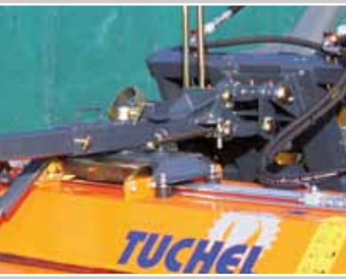
Yard loader / Front loader attachment incl. parallelogram and pendulum compensation incl. height indicator